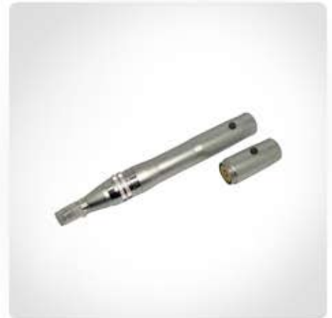
Derma Pen Ultima with 0.25mm to 2.5mm