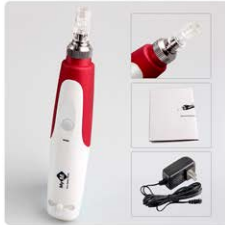
Derma Pen Pro with 0.25mm to 2.0mm