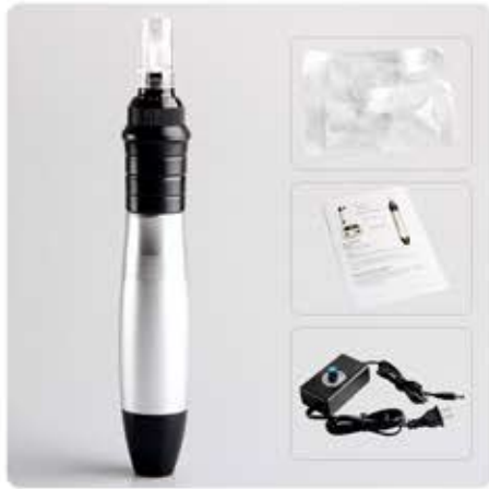
Derma Pen Basic with 0.25mm to 2.0mm